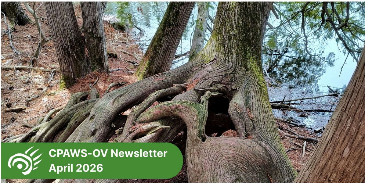
Old growth in Shaw Woods